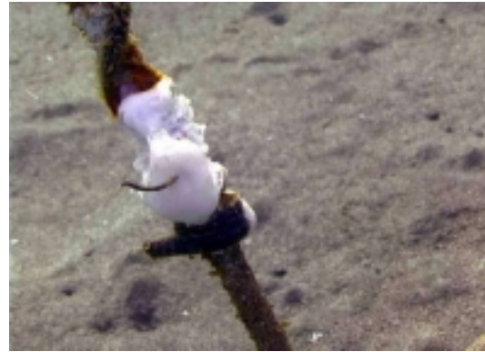
Limestone quickly covers the metal frame. Bali.

To build a Biorock reef, an electrically conductive frame, often made from construction grade rebar or wire mesh, is welded together, submerged and anchored to the sea bottom. Sizes and configurations vary to fit the setting. Then a low voltage direct current is applied using an anode (power sources can include chargers, windmills, solar panels or tidal current generators). This initiates an electrolytic reaction causing minerals naturally found in seawater, mainly calcium carbonate and magnesium hydroxide, to grow on the structure.