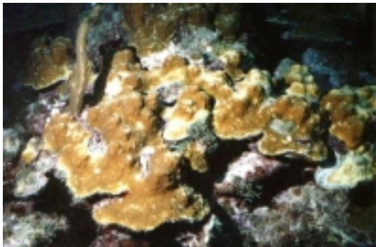
Coral bleaching is now common in reefs around the world. Bonaire, NA

When coral reefs die, fish populations disappear; beaches and shorelines are damaged. Unprotected by breakwaters, fragile land areas become vulnerable to erosion, saltwater intrusion and destruction from waves.