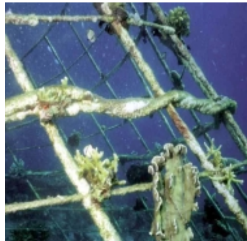
Coral fragments transplanted to the structure soon begin to grow. Bali.

Once the reef structure is in place and minerals begin to coat the surface, the next phase of reef construction begins. Divers transplant coral fragments from other reefs and attach them to the ark's frame. Immediately, these coral pieces begin to bond to the substrate and start to grow—typically three to five times faster than normal. Soon the reef takes on the appearance and utility of a natural reef ecosystem rather than a man made one.