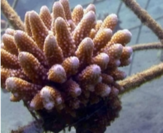
As the corals grow, the structure takes on the appearance of a conventional reef attracting a wide variety of indigenous marine life. Bali.

Coral species gain a major advantage over the weedy organisms that often overgrow them in areas stressed by eutrophication. In tests where the electrical current is interrupted, the Biorock Process stops and weeds begin to cover the corals. But, when the current is maintained, coral reefs grow well, even as neighboring reefs without current die.