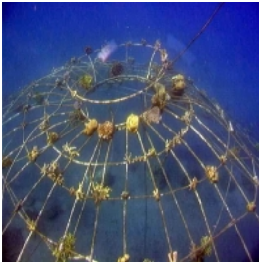
Structures can be any shape or size depending only on available materials and power. Bali, Indonesia.

Biorock methods provide a cost-effective way to increase coral survival from bleaching and disease, while restoring damaged reefs. In time, these structures cement themselves to the ocean bottom, providing a physical barrier that can protect coastlines from waves and currents that cause erosion.