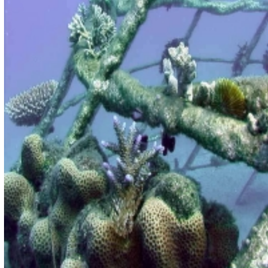
Healthy corals grow quickly—up to ten times faster than normal when exposed to electrolysis, even in poor water conditions. Bali.

Biorock structures have unlimited potential for making breakwaters that actually get stronger with age. If waves or colliding ships cause damage, Biorock makes them, to an extent, self-repairing.