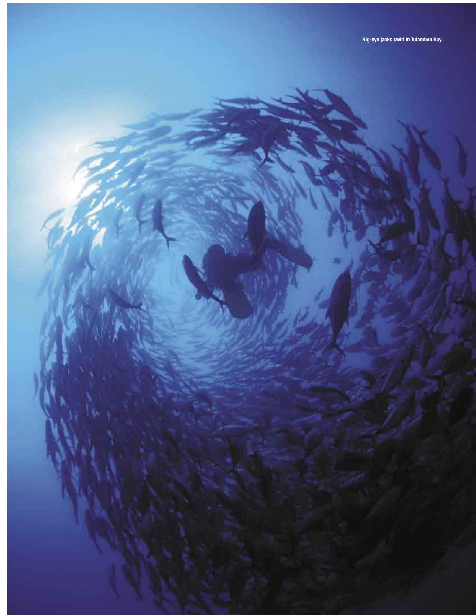
Big-eye jacks swirl in Tulamben Bay.

BALI — the images flash in my mind of majestic volcanoes, traditional architecture, beautiful offerings of flowers, thousands of colourful fishes, shimmering blue waters behind tall forests of soft corals, and secret bays of mysterious critters as yet unknown to science. Resilient to the after-effects of the October 2002 bombing, Kuta now seem fresh, new and vibrant with the latest surf fashion, designer labels and delicate works of art on canvas, wood and stone. It is time to rediscover Bali, the island of the gods and part of the richest reef system of the world.