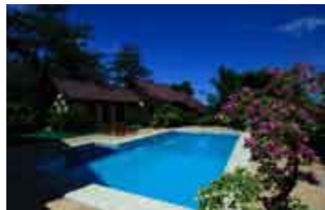
Tulamben Wreck Divers Resort