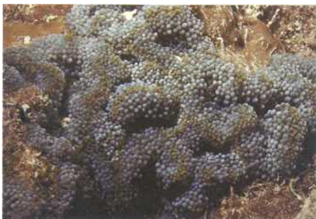
The color of the corallike anemone Ricordia florida varies naturally in shades of blue or green, as in the normal specimen (above right). At the height of the bleaching event, the anemone is a pale shadow of its former self (above, left). It is hoped that it, and others, will recover their vital colors, as this elkhorn coral ( Acropora palmata , right) is doing in the Florida Keys.