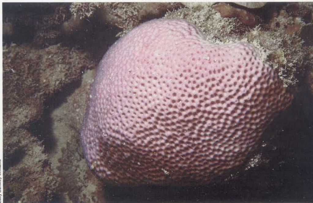
Lucy Bunkley Williams

Bleached lavender, the color of the skeleton of this starlet coral ( Siderastrea ) is normally masked by its zooxanthellae. Patches of the masking algae can still be seen at the bottom and right side of the coral. Many species exhibit splotchy bleaching.